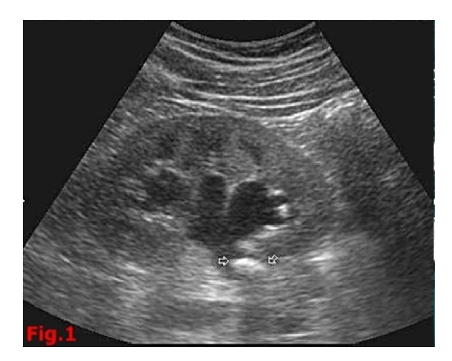
Fig.1. Ultrasonogram showing hydronephrotic right kidney with multiple renal calculi

invasive carcinoma of transitional type (TCC grade II/III) with tiny foci of squamous metaplasia (Fig.3).