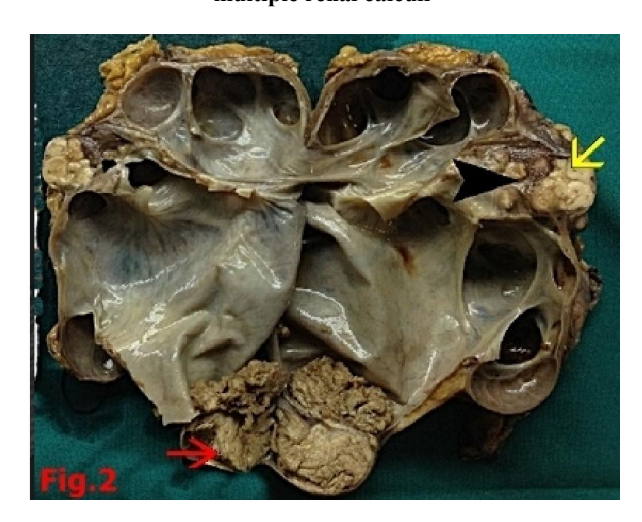
Fig. 2. Gross picture showing a globular mass at the PUJ (red arrow) and another small growth at the middle of right kidney (yellow arrow)