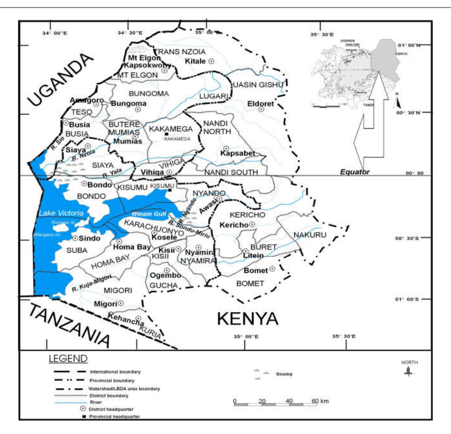
Figure 1: Map of Western Kenya showing location of River Nyando Basin

dynamics. When the respondents were asked to indicate the extent to which the projects had involved members of the local communities in monitoring and evaluation, 52% of the respondents said that they had never been involved in monitoring and evaluation of project activities, nor were they involved in the development of monitoring and evaluation tools. When they were asked to indicate whether the projects held stakeholder forums, 51.3% of the respondents reported that the projects held stakeholder forums, a good number of respondents, 40.7%, noted that the level of collaboration and partnership between different afforestation stakeholders was low (Table 1).