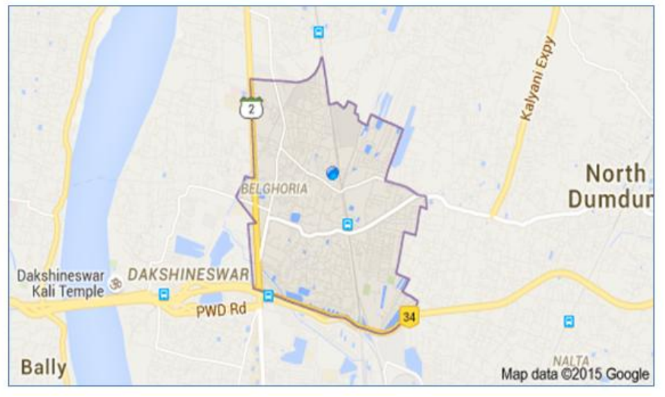
Figure 1. Map of the Regional Industry

The finished products are supplied in small packs through trains or heavy loads through roadways to far distant markets of Kolkata, Howrah, Hooghly, North and South 24 Paraganas, Nadia, North Bengal and Assam. Often contractors purchase the finished product to supply them to the formal sector of the industry (locally called 'company'), thereby incorporating a formal-informal linkage in which intermediate mere production appears in the informal sector which gets a finishing touch with labeling-branding and is ready for sale in by the formal sector at a higher price than the informal sector prices. The consumers coming from the upper milieu of the society prefer to purchase these high-priced branded products when security and quality assurance are the main factors, while middle and low income group prefer the low-priced informal sector produces with enough bargaining processes when making lesser expenses on the item purchased appears to be the major concern. The informal tie-up and bonding in the product market has targeted the latter phenomenon in order to ensure faster expansion of the industry. Therefore, industrial production appears in the informal sector, sale appears both in the formal and informal sector, and export appears both by the formal and informal sector.