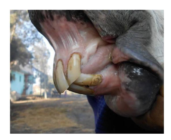
Fig. 5. 7-year old donkey showing incisors overjet (brachygnathism) and hypercementosis of lower incisor