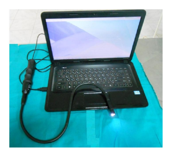
Fig. 1. The endoscope attached to a laptop

All of the presented donkeys were found suffering from different varieties of dental disorders or abnormalities despite their owners' histories were devoid of any dental complaints. Although no gender association with dental disorders or abnormalities was recorded, younger age donkeys were highly presented. Wheat bran and straws were the most common feed as a preservative ration in dry season in combination with leguminous forages only in the winter. Some donkeys of poor owners were allowed to graze on poor pasture.