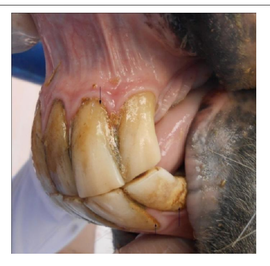
Fig. 2A. 9-year old female donkey showing dental tartar with gingivitis (upper incisors)and hypercementosis (lower incisors)(black arrows)

Table 1 summarized the distribution of dental disorders or abnormalities among the presented donkey cases. As shown in table 1, the presented cases had a high prevalence of incisor and canine dental tartar and calculus ((97%) (Fig. 2).