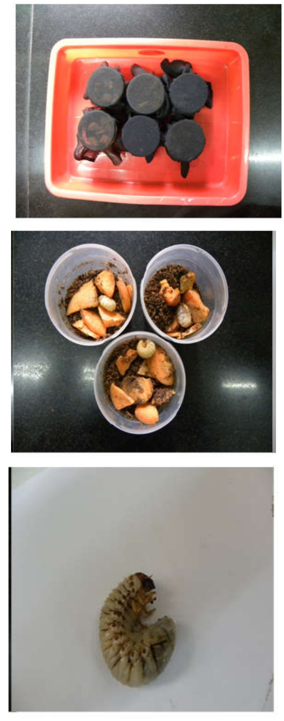
Plate 1 Rearing root grubs on sliced carrots

The field collected adult beetles were placed in large plastic containers containing organic matter and soil. The adult beetles were provided with neem leaves and allowed for mating and oviposition.