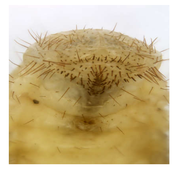
Plate 3. Anal slit and raster pattern Melolonthinae in rutelinae