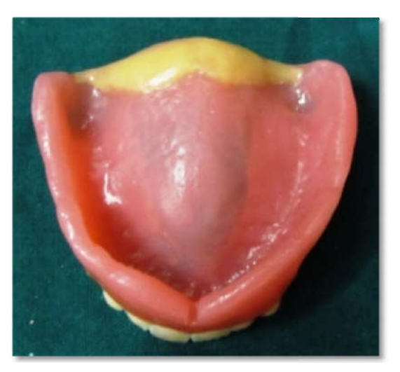
Fig.1. Illustrates Posterior palatal seal area recorded with fluid wax

was repeated for perceptual and acoustic analysis when the wax was scraped off (simulating absence of posterior palatal seal area record in the denture)(Fig 1,2,3).