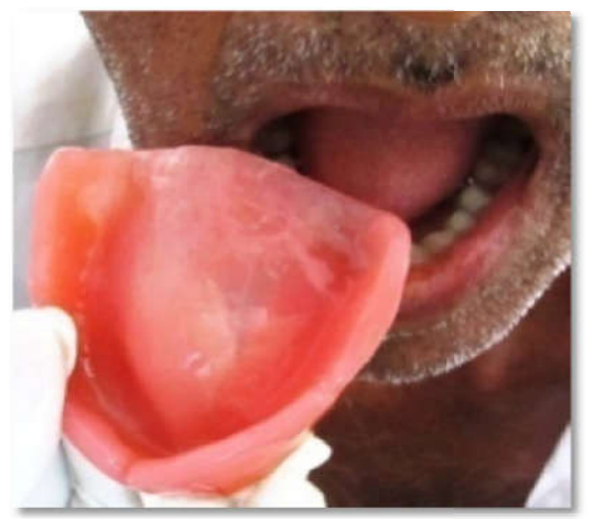
Fig. 3. Illustrates insertion of denture for recording speech intelligibility, for perceptual and acoustic analysis without the posterior palatal seal area record (fluid wax simulating P.P.S was scraped off)