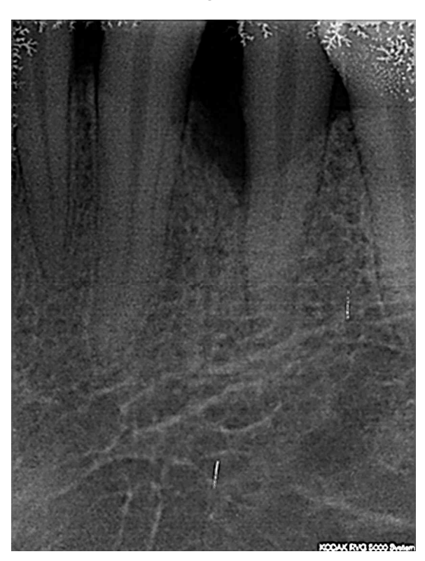
Fig.2. 5mm infrabony defect