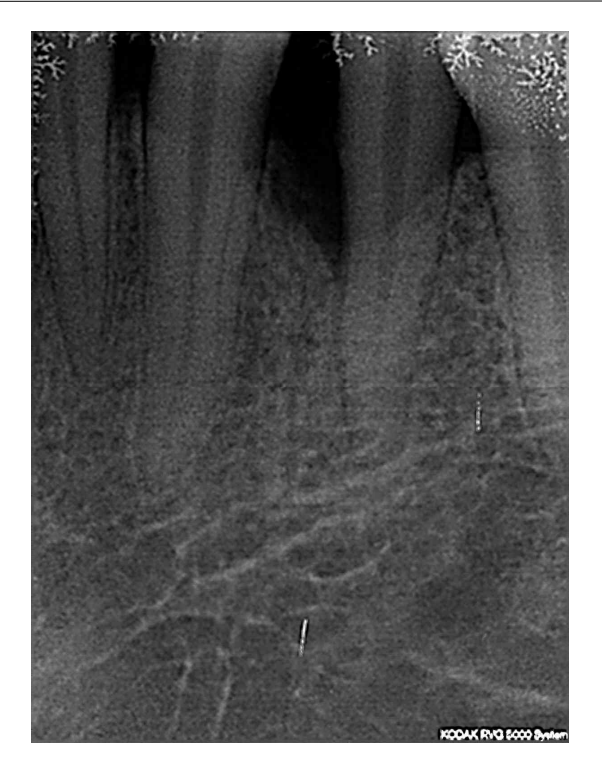
Fig. 10. Post-op-35 after 6 months

Routine blood investigations with random blood sugar and INR were also advised to the patient before the surgical intervention. After ensuring that the all routine investigations of the patient were within the normal limits, Open flap debridement (OFD) of the lesion was performed under local anesthesia (2% LIGNOCAINE HCL with ADR). A circumoral preparation with betadine was done first to prevent transfer of resident skin flora to the intraoral site. Mouth was disinfected by using 0.2% chlorhexidine mouthrinse prior to surgery for 60 seconds Bony defect was thouroughly debrided, root planned and scaled with gracey curettes (Fig-3). After debridement PRF membrane was prepared by centrifuging 10ml of venous blood at 2700rpm for 12minutes under strict septic conditions. Three different layers were obtained on centrifugation, middle layer of platelet rich fibrin was retrieved from the vacutainers with the help of sterile tweezer and pair of scissors. The platelet rich fibrin was placed between two saline wet gauze pieces and digital pressure was applied. Other two layers were discarded. (Fig-4,5).