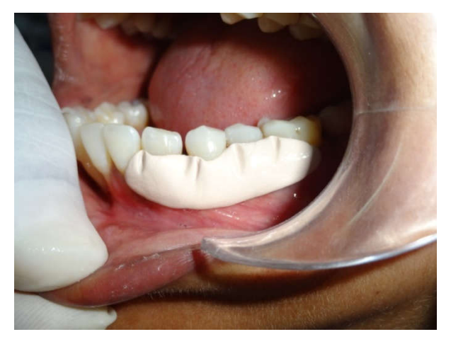
Fig.8. Coe-pak in place