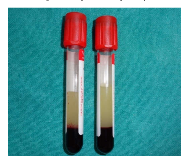
Fig.4. Vaccutainers with centrifuged blood showing 3layers