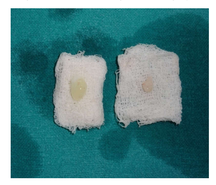
Fig. 5. PRF membrane