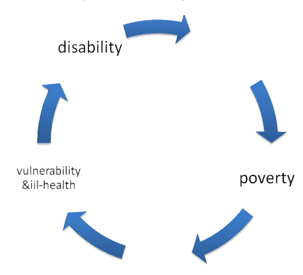
Figure 2. Vicious circle of poverty and disability

The management of these schools has however been taken over by the ministry of education. However the attitude of the society has remained negative towards disability and this has led to restrictions in the environment that hamper the progress of persons with disabilities as explained by the social model on disability.