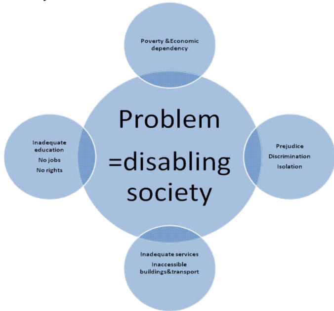
Figure 3. Social Model of disability

The management of these schools has however been taken over by the ministry of education. However the attitude of the society has remained negative towards disability and this has led to restrictions in the environment that hamper the progress of persons with disabilities as explained by the social model on disability.