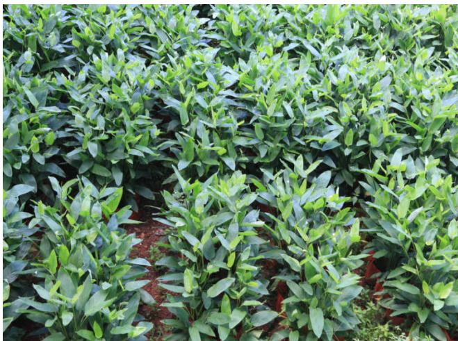
Fig. 1. The population of Maranta arundinacea grown for the present study

A population of 540 plants, raised from the 60 accessions of Maranta arundinacea collected, was evaluated for the genetic control of agronomic characters. The plants were grown in the experimental field of the Genetics and Plant Breeding Division of Department of Botany, University of Calicut, Kerala, India during the first crop season of 2013 (Fig.1).