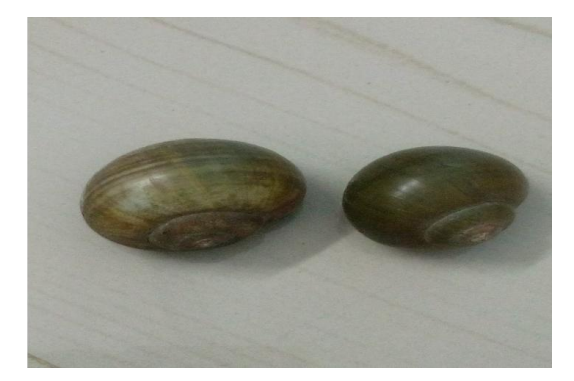
Fig. 4. Pila globosa