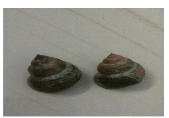
Fig. 3. Bellamya bengalensis