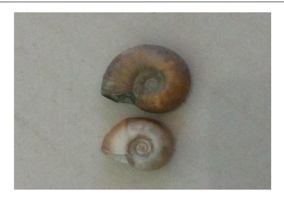
Fig. 1. Gyraulus convexiusculus

Abhijit Das and Subhajit Biswas, Analysis of certain physico chemical parameters of river mara bharali in the sonitpur district of assam, india with special reference to its molluscan diversity