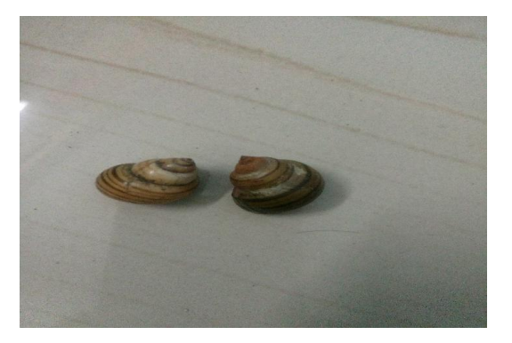
Fig. 2. Gabbia orcula