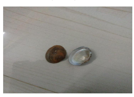
Fig. 6. Lamellidens marginalis

Total dissolved solids: Total dissolved solid depends on various factors such as geological character of watershed, rainfall and amount of surface runoffs and gives an indication of the degree of dissolved substances (Driche, 2008; Siebert, 2010). According to Wilcox (1955) aquatic media is classified based on the concentration of TDS. Water is desirable for drinking up to a TDS permissible limit of 500 mg/L. TDS in water is found due to content of carbonates, bicarbonates, chlorides, phosphates and nitrates of calcium, magnesium, sodium, potassium, manganese, organic matter salt and other particles (Fakayode, 2005). The total dissolved solids found at