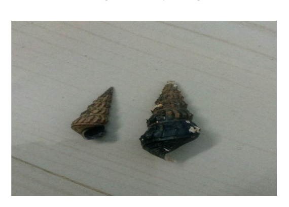
Fig. 5. Brotia costula

The WHO permissible limit for turbidity of drinking water is between 5 - 25 NTU. As water became more turbid, less sunlight can penetrate and therefore the rate of photosynthetic activity is lowered. In addition, suspended materials absorbed heat from sunlight and raise the water temperature which indicate limited amount of dissolved oxygen in water (Thorvat et al. , 2012).Turbidity of river water can be low or high depending on the water current and sedimentation (Smitha and Shivashankar, 2013).