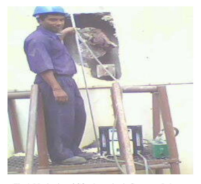
Fig. 1. Monitoring of CO<sub>2</sub> absorption in flue gas at Industry

The Oligomeric Chitosan solution (1 %) was tested for CO_2 absorption several times at laboratory & at industry. The details at the time of monitoring at industry are given in Table 1. The CO_2 removal efficiency of 1% Oligomeric Chitosan & 1% MEA is shown in Figure 2. Significantly high CO_2 absorption was observed for aminated glucose. The results showed that 10.65 gms of CO_2 was absorbed in 100 ml of 1% solution of aminated glucose and is higher by a factor of 21.5 at breakthrough point as compared to 1% solution of MEA.