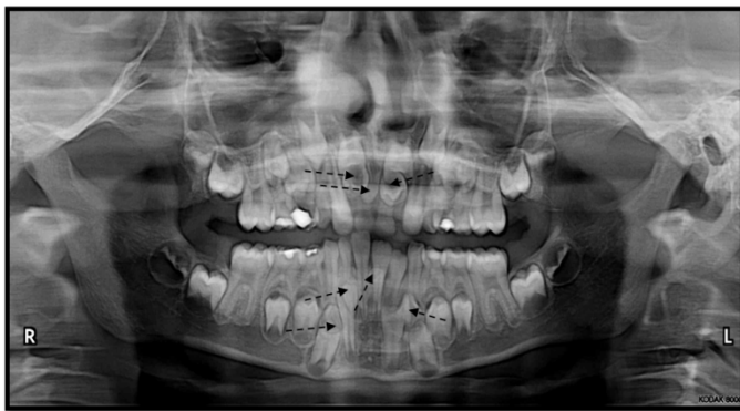
Figure 1. Digital panoramic radiograph showing the presence of 7 supernumerary teeth- three supernumerary teeth seen in the maxillary canine-canine area bilaterally and four in the mandibular canine- canine region bilaterally. The arrows represent the supernumerary teeth

The proposed treatment plan consisted of extraction of the retained deciduous incisors and periodic check-ups. Following administration of local anaesthesia, extraction of the deciduous maxillary incisors was performed to allow the impacted mesiodens to erupt spontaneously or to facilitate its eruption. It has been found that 75% of impacted teeth may erupt within 18 months of removal of the supernumerary tooth (Di Biase, 1969). Presently, the patient is being followed up through semi-annual recall examinations. The decayed teeth were restored followed by preventive oral health measures. Thus, it was decided to allow for the spontaneous eruption of the permanent central incisors and the supernumerary teeth following which the extraction of the supernumeraries would be carried out.