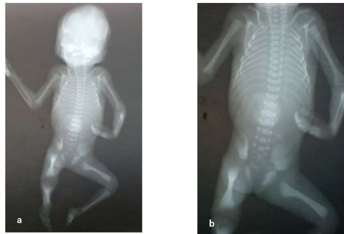
Fig. 2. Showing a. radiograph OFD foetus showing short forearm bones on the left side b. showing clubbed left hand