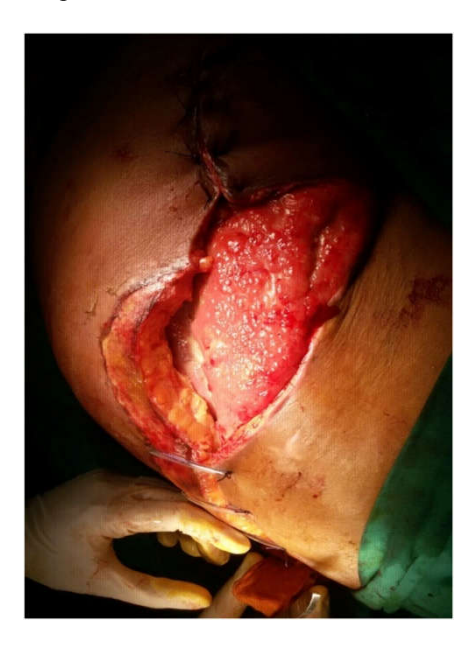
Figure 1. Intra-operative picture of the wound over proximal thigh being approximated with tension suturing

Its synonyms include Morel-Lavalléeseroma, Post-traumatic extravasation, post-traumatic soft tissue cyst or Morel Lavallée effusion (Mellado et al. , 2004). MLL is degloving injury of extremities which is closed injury sustained after a shearing force trauma. Skin and subcutaneous tissue gets separated from underlying fascia thus creating a cavity which can accumulate blood, seroma or fat. Blood or seroma accumulates because of disrupted capillaries that continuously drained into perifascial plane. Subsequent inflammation around fascia leads to formation of capsule if left untreated.