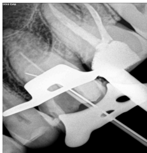
Fig. d. Two canals in mesiobuccal root