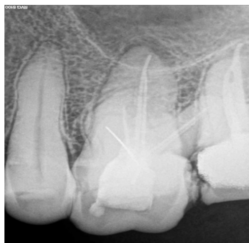
Fig. f. Obturation showing all the six canals