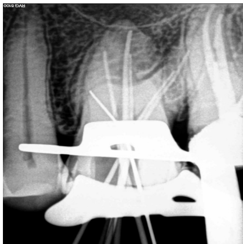
Fig. e. Master Cone radiograph