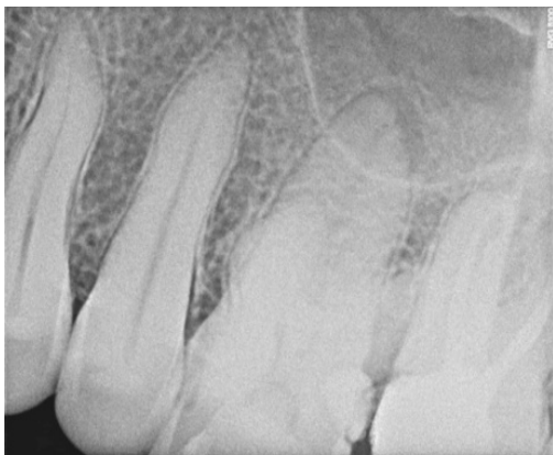
Fig. a. Preoperative radiograph

All the orifices were explored using DG-16 endodontic explorer. A ISO size # 10-k file placed into canals to check the patency. The working length of canals was determined by using Radiovisiography. The root canal preparation was done by using stainless steel (SS) 21 mm K-files (Dentsply/ Maillefer, Ballaigues, Switzerland) in a step-back manner through size # 30 by quarter-turn-pull technique. Glyde FILE PREP (10 % carbamide peroxide and 15% EDTA gel) was used for lubrication during instrumentation with each file size and canals were irrigated using 27 gauge needle with 5% sodium hypochlorite followed by normal saline after every instrument used. Once the tooth was asymptomatic master cone radiograph was taken (Fig.e) showing all the six canals. Second mesiobuccal canal (MB2) was obturated with silver cone and