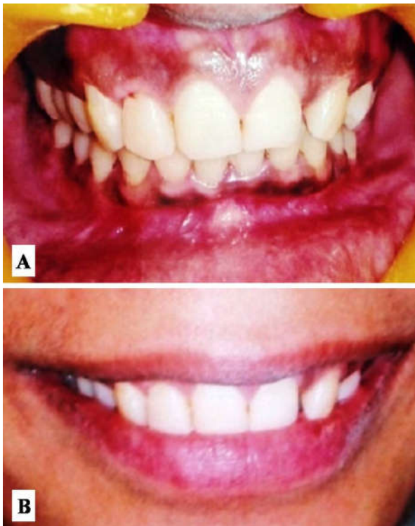
Figure 5 (A & B): Post-operative photograph