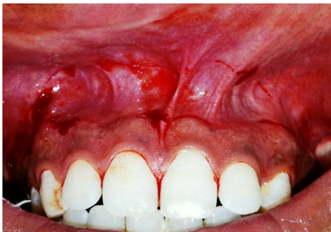
Figure 7. Incisions made using scalpel