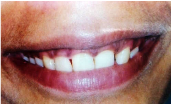
Figure 1. Pre-operative photograph

A 21-year-old female patient reported to the Department of Periodontology with a complaint of small appearance of her teeth and desired a more esthetic smile (Figure 1). There was no history of swelling in any part of the oral cavity and had no relevant medical history. On examination it was seen that the crown of the maxillary anterior teeth were covered with the gingiva, giving an appearance of small clinical crown in the maxillary anterior region. The oral hygiene status was found to be good. Intraoral periapical radiograph (IOPAR) revealed no abnormalities in the region. Blood examinations of the patient revealed normal values.