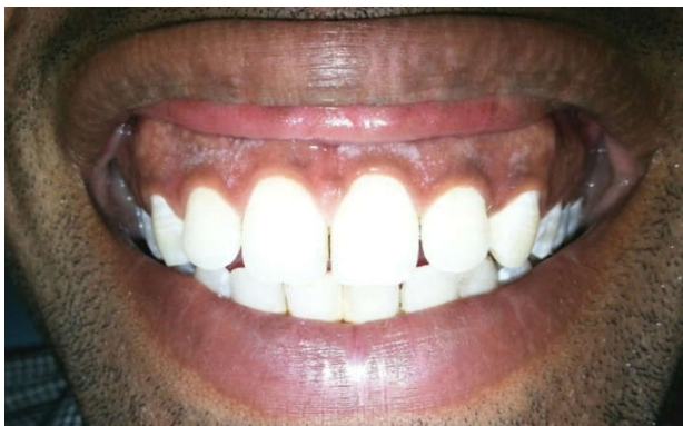
Figure 6. Pre-operative photograph