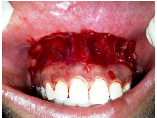
Figure 8. Exposed submucosa after removal of the mucosal strips

The treatment comprised of oral prophylaxis and lip repositioning surgery. Complete mouth disinfection was performed followed by anesthetization of the surgical site.