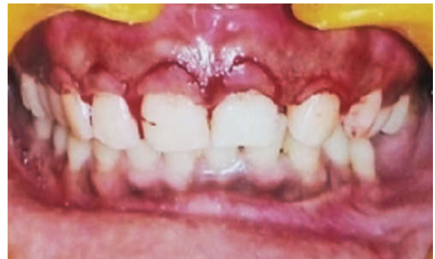
Figure 4. Incision made using BP blade no.11

Post-operative instructions were given to the patient along with prescription of Tab. Diclomol, 8hrly for 3 days and Chlorhexidine gluconate for rinsing twice daily for 7 days. The patient was recalled after 1 week and then after 3 months. The healing was uneventful & satisfactory without any sign of trauma to the underlying structures (Figure 5).