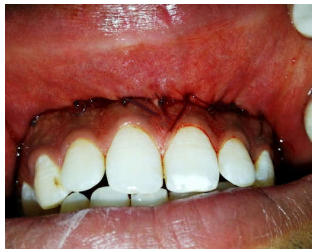
Figure 9. Intra-oral appearance following suturing