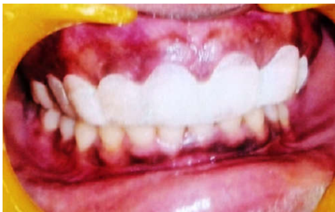
Figure 2. Surgical stent placed.