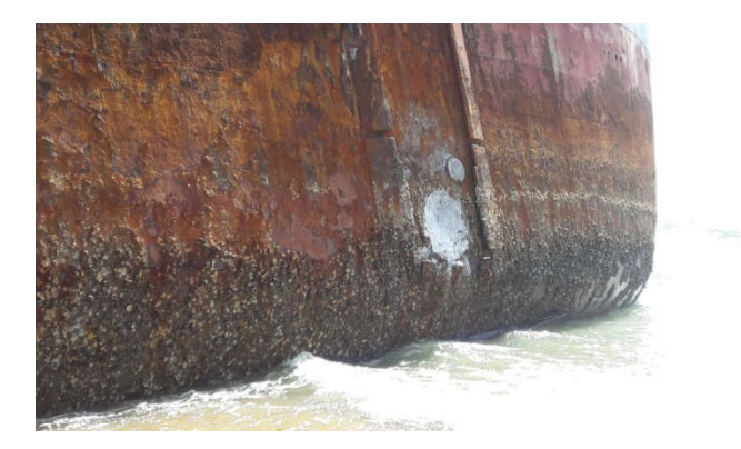
Figure 4. Corrosion caused by biofoulers on the hull

Biofouling makes the hull surface more susceptible to corrosion and discoloration (Joseph and Ruey, 1999). The present findings on the hull of dredging vessel, biofouling leads to discoloration and corrosion. On conclusion the Barnacle sp. and Pinctada sp. were heavily fouled on the vessel result in the corrosion. The dead organisms stimulates local corrosion leaving more or less circular patches of damage (Fig.4). The metabolic products of fouling and particularly the production of acid conditions and hydrogen sulphide by dving members of the community creates a condition that favourable corrosion (Clapp, 1944). The Dredger HANSITA washed up on the Mundakal beach gives a clear picture of heavy fouling on the vessel hull top to bottom that leads to corrosion of the vessel. In the aftermath of this incident, over 15 houses in the locality got collapsed, while about 250 metre of the shore was lost due to surge in sea levels, posing risks to the Coastal Road.