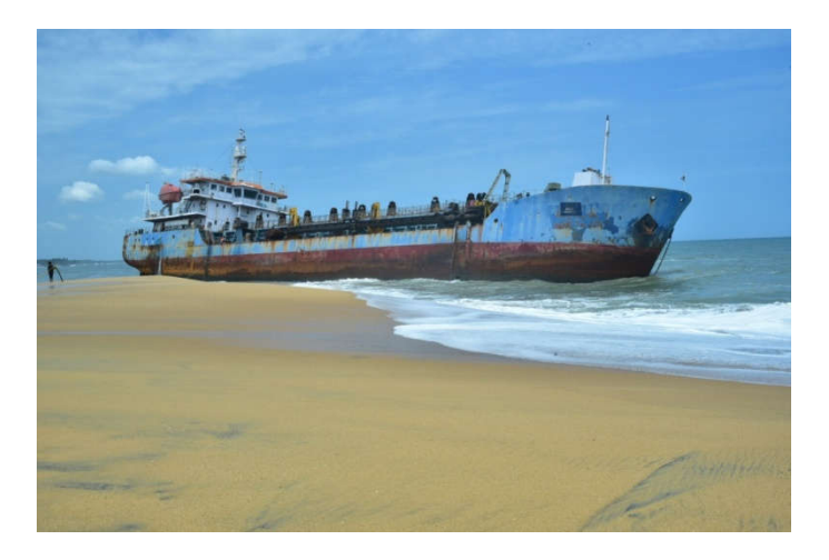
Figure 1. Dredger HANSITA V washed up on Mundakkal Coast

primarily made up of crustaceans, mollusc and crabs (Gollasch, 2002). Chambers et al (2006) pointed out that where niche areas are available on the substrate, higher fouling organism may settle ahead of other species.