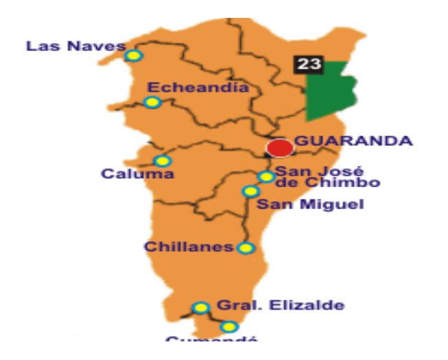
Figure 1. Political Administrative Map of the Bolivar Province, Ecuador

The study was carried out with retrospective data of the cases of PVC consulted among the years 2007 at the 2010 in the Veterinary Hospital "Canine and Felines" of the city of Guaranda, Bolivar Province, Ecuador; with which the enzootic channels of the illness were determined in the territory. The Canton is located among the 1° 34' 20" LN and the 78° 58' 10" LW, to a height of 2668 msnm, in the center of the country, in the interandine region, specifically in the western mountain range of the Andes. It possesses a territorial extension of 1898 km2, it limits to the north with the county of Cotopaxi, to the south with San Miguel's Canton, to the east with the counties Tungurahua and Chimborazo and to the west with the Cantons of Chimbo, Caluma and Echeandia (Figure 1). The temperature averages yearly it is of 15,2°C; the maxims oscillate between 22 and 24°C (July and August) and the minimum ones between 5 and 7°C (December and January). The annual precipitation is of 980,3 mm, with a monthly average of 81,3 mm; the rainiest month is March with 184,3 mm and the less rainy one is September with 11,5 mm. The relative humidity I average yearly it is of 70%.