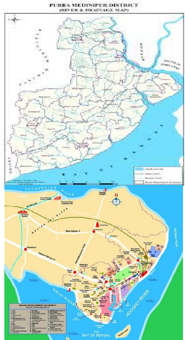
Figure 1. Sampling places of Haldi River

the sequence of Pb > Cu > Zn > Cd at that site. Maximum amount of metal found in sample water was lead (Pb). The values of lead observed 4.175 µg/L.