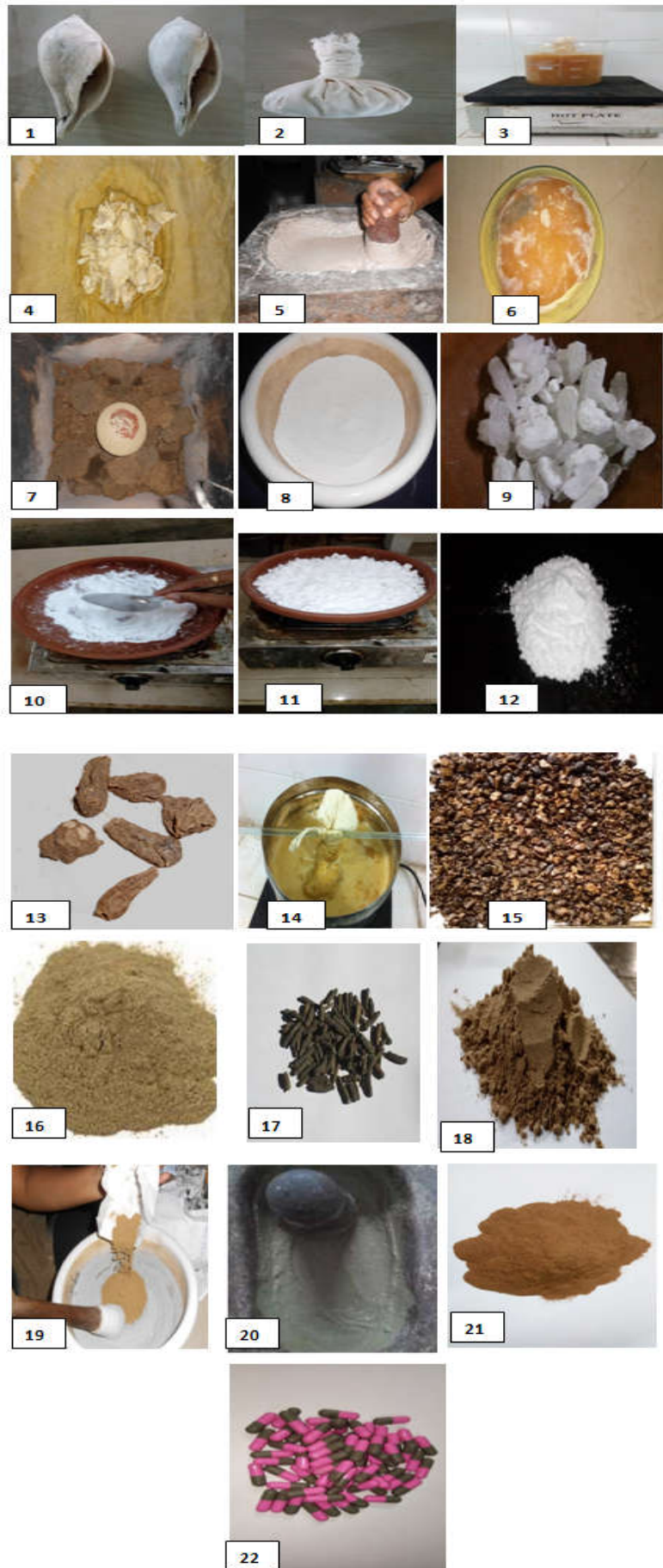
Figure 1. Ashuddha shankha ; 2- Pottali of Shankha; 3- Swedana in nimbuswarasa; 4- Shoditashankha; 5- Bhavana of shankha with Nimbusarasa; 6- Sealed sharvasamputa; 7-Gaja puta; 8- Shankhabhasma; 9- Ashuddha Tankana; 10- Heating onf Ashuddha tankana churna on mild flame; 11- Shuddha tankana after Nirjalikarana; 12- Shuddha tankana churna; 13- Ashuddha Vatsanabha; 14- Ashuddha vatsanabha shodhana in Gokisheera; 15- Shodhita Vatsanabha; 16- Shoditavatsanabha Churna; 17- Pippali; 18-Pippali Churna; 19- Mixing of all ingredients; 20- Bhavana with ardrakaswarasa; 21- Kaphakethuras 22- Kapha keturas capsules