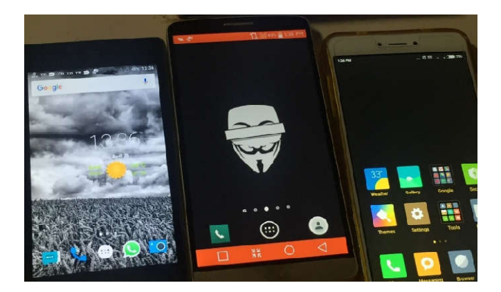
Fig.3: Signals Jammed (no signal on mobile)