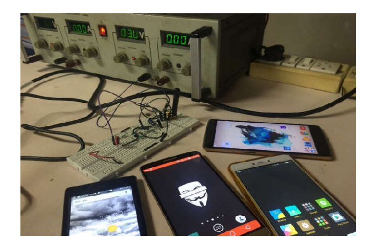
Fig.2 Connection and respective mounting for the project