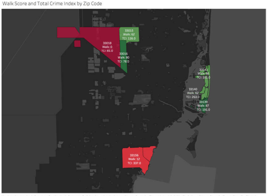
Map based on Longitude (generated) and Latitude (generated). Color shows details about walk score for code. The marks are labeled by Zip Code, walk score for code, Transit Score For Zip and average of Total Crime Index. Details are shown for Zip Code.

In order to study these environmental measures, total crime indexes and Walk Scores were mapped together using Tableau