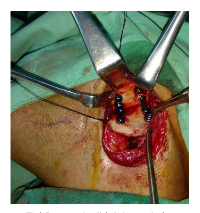
Fig 2. Intraoperative clinical photograph after reduction and fixation of bony segments