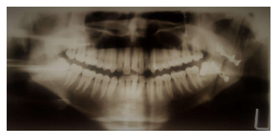
Fig 3. Panoramic radiograph showing the post-operative reduction and fixation

Routine blood investigations were send and panoramic radiograph was advised. OPG showed fractures mandible in the left mandible with the fracture line passing from the posterior border of mid-ramus to the lower border of mandible just below the roots of second molar. Over-ridding was also noted in the superior region of fractured segments. CT scan was advised to evaluate the unusual fractured line and same fractured line was obtained as by the panoramic radiograph with additional finding of medially displaced fractured segment (Fig. 1). No classification used clinically was applicable to this type of fracture line. Open reduction and internal fixation was planned under general anesthesia though submandibular approach.