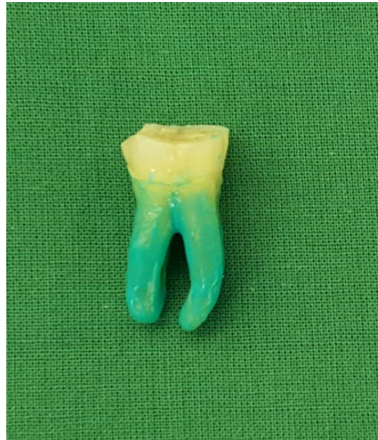
Figure 1. Replication of periodontal ligament space using addition silicone

The teeth were then embedded separately in a self cured acrylic resin blocks (2.5cm×2.5cm). After initial polymerization, each tooth was removed carefully from the respective resin blocks. The foil was gently detached from the surface of the roots and light body addition silicone impression material was injected into the acrylic resin blocks in the place that was earlier occupied by the root of the tooth and foil. The teeth were then inserted again in the the resin blocks. A homogeneous silicone coat that replicated periodontal ligament was thus created taking the foil thickness (Fig 1).