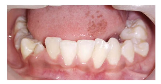
Figure 4b. 12 months follow up