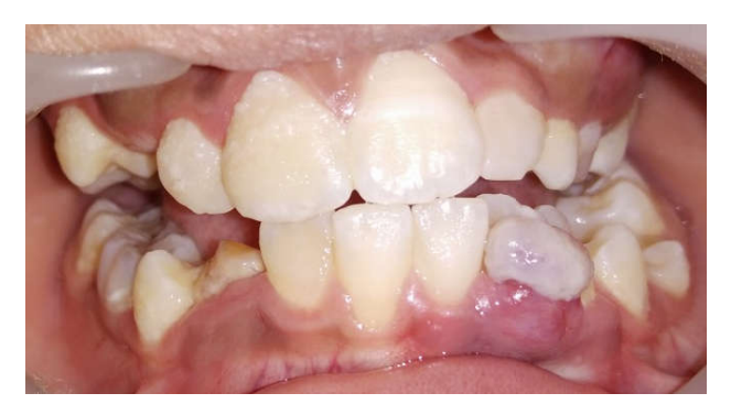
Figure 1. Gingival overgrowth

The biopsy of the soft tissue was done and microscopic features were found which showed H an E stained section with parakeratinized stratified squamous epithelium, underlying connective tissue stroma shows numerous chronic inflammatory cells and blood vessels (Figure 5).