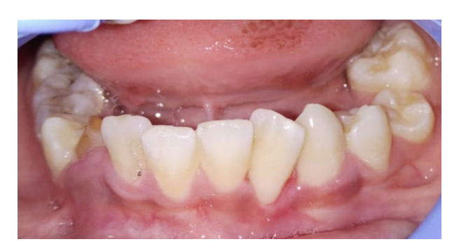
Figure 4a. 1 week follow up