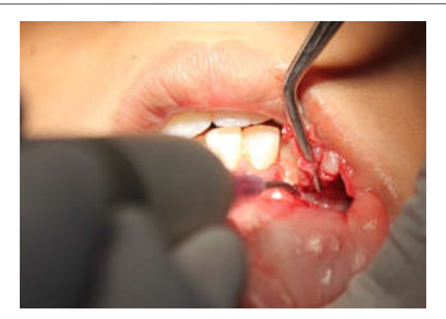
Figure 3a. Surgical excision with laser