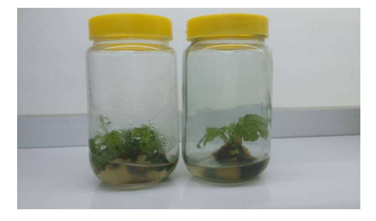
Figure 1. Establishment stage of fig soltani and abiad on Morashige and Skoog media