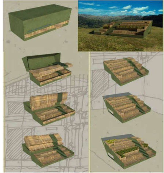
Figure 2. All time present artifacts by Çagatay Ozer

The upper part of mobile amphitheater shall provide the power need of user (such as mobile phone battery) with the solar panel. It is aimed to color the environment with the ornamental plants placed on open wings. Moreover, it is aimed to prevent environmental pollution with the garbage bins on side wing (Fig. 2).