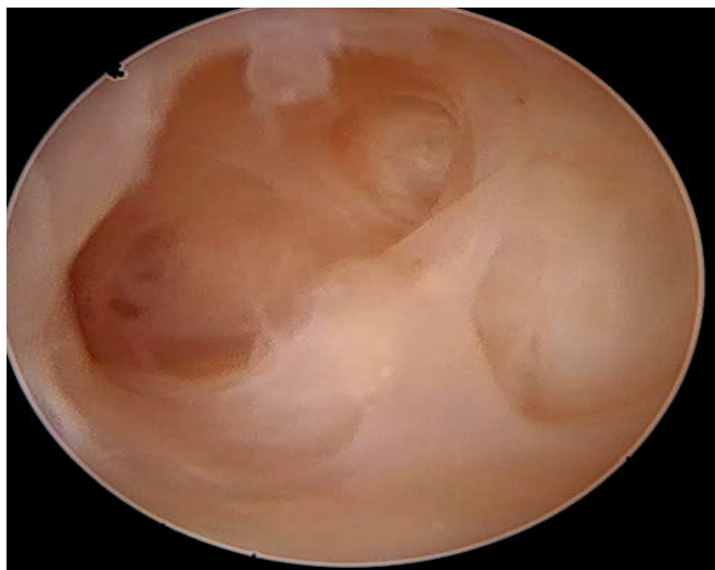
Fig. 1. Hysteroscopic picture