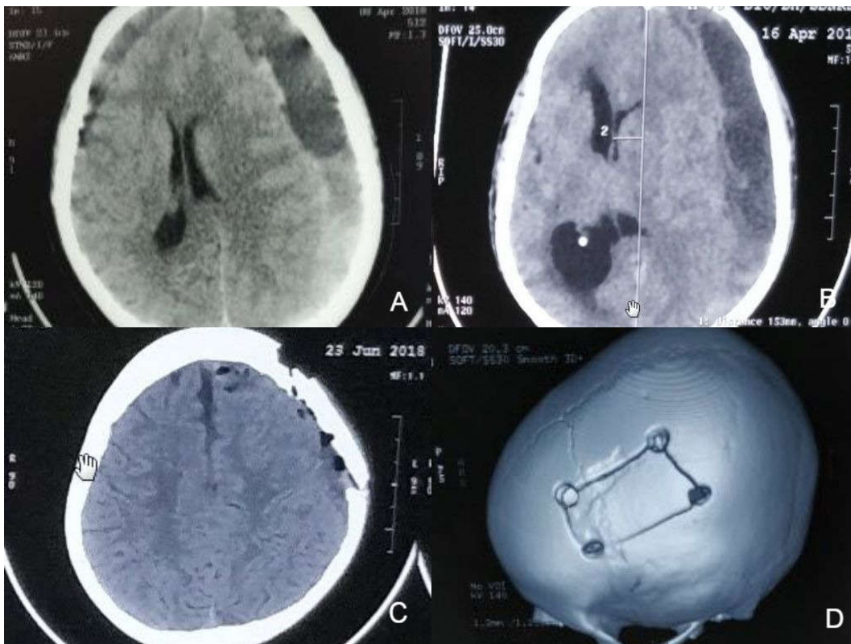
Fig 1. [A] Bilateral cSDH with intrahaematomal membranes on the left side. [B] Left Fronto-parietal cSDH with intrahaematomal membranes. [C] Post-operative CT scan following a small craniotomy for cSDH. [D] 3D reconstructed CT scan image of the craniotomy flap of the same individual in Fig 1.