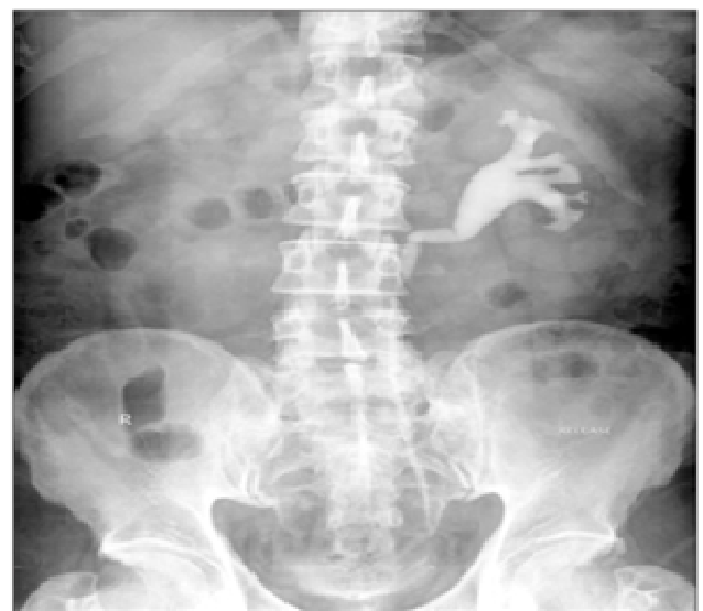
Fig. 1. Intravenous urography showing medialization of left ureter with hydronephrosis and poorly functioning right kidney

The mean ( \pm standard deviation) hemoglobin at presentation was 10.84 \pm 2.4 g/dL. Acute/chronic renal insufficiency was present in 15 patients (71.43%). The median creatinine level was 1.8 mg/dL. ESR at presentation was available for 10 patients (47.6%), and was elevated ( >30 mm in 1st hour) in all of them. The mean ( \pm standard deviation) ESR was 53.2 \pm 16.71 mm in 1st hour. Hydronephrosis of right kidney was present in 5 patients (23.81%), left kidney 6 patients (28.6%) and was bilateral in 10 patients (47.62%) on USG, intravenous urography or CT-scan (Fig. 1). Small kidneys were present in 10 patients (47.6%). Out of the 18 patients who underwent CT-scan or PET-CT scan at the time of presentation, 11 patients (61.1%) had a diffuse retroperitoneal mass encasing unilateral and/or bilateral ureters with or without the encasement of vessels (Fig. 2). Seven patients (38.9%) had periaortitis but no obvious diffuse retroperitoneal mass.