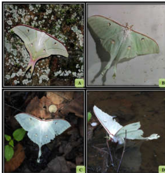
Figure 2. A. Actias selene (Hubner, 1806), Santipur, Nadia; B. Actias selene (Hubner, 1806), Belpahari, Jhargram; C. Top view of Actias selene (Hubner, 1806), Ajodhya hill, Purulia; D. Front view of Actias selene (Hubner, 1806), Ajodhya hill, Purulia