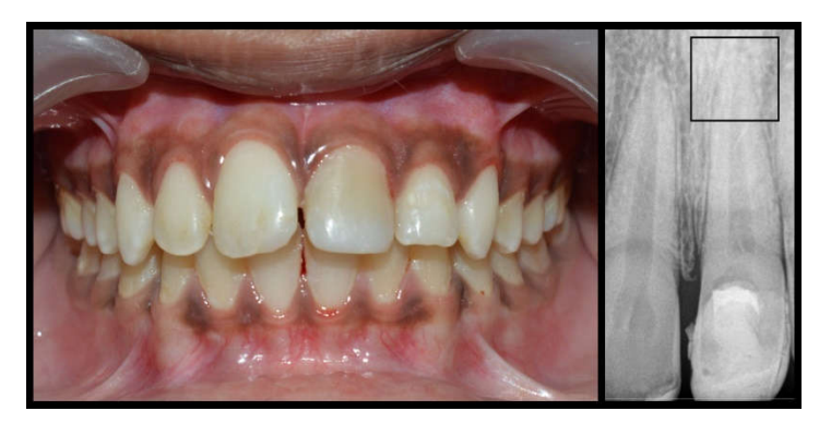
Figure 4. Double sealed with GIC and Composite restoration and rvg after 1 year there is continued thickening of the dentinal walls, root lengthening, and apical closure