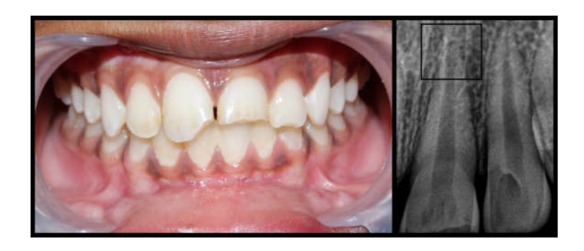
Figure 1. Broken upper front tooth 21 and preoperative rvg showing immature root and an open apex associated with thin dentinal walls