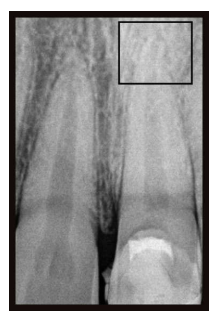
Figure 3. Rvg 6 months after procedure showing gradual closure of root apex