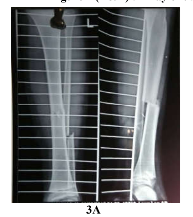
Figure 3 : 3A Xray showing fracture of tibial diaphysis

Figure 2 (A&B) : X ray of tibial fracture operated with TENS