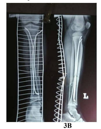
3B X ray showing fracture treated with TENS