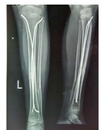
Figure 4. Xray showing union of fracture after treatment with TENS