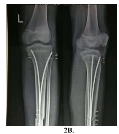
Figure 2 (A&B) : X ray of tibial fracture operated with TENS