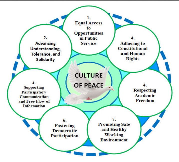
Figure 2. The Peace Building Theory