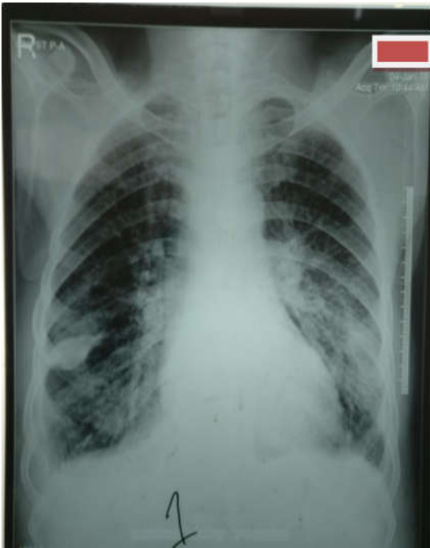
Fig. 1. CXR of the patient at the time of admission