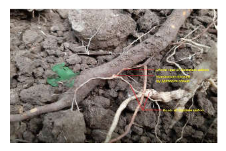
Fig. Host parasite relationship between Santalum album and Coccinia indica