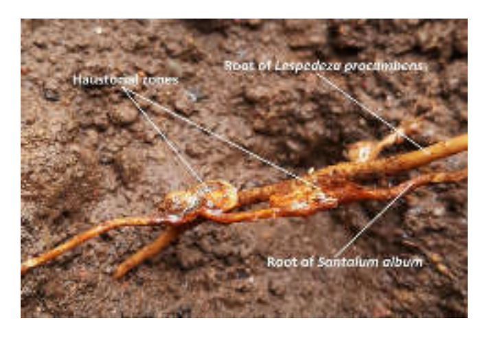
Fig. Host-parasite relationship between Santalum album and Lespedeza procumbens

well-developed haustorium formed by the parasite, coupled with the lack of defensive mechanism of the host, and the presence of ample nitrogenous compounds in the xylem sap accessible to the parasite's haustorium, govem the host quality of legumes. Our results show that the comparison of \delta 15N signatures of the parasite and its potential hosts gives a good indication of the N2-fixing plants likely to act as principal N sources to S. album .