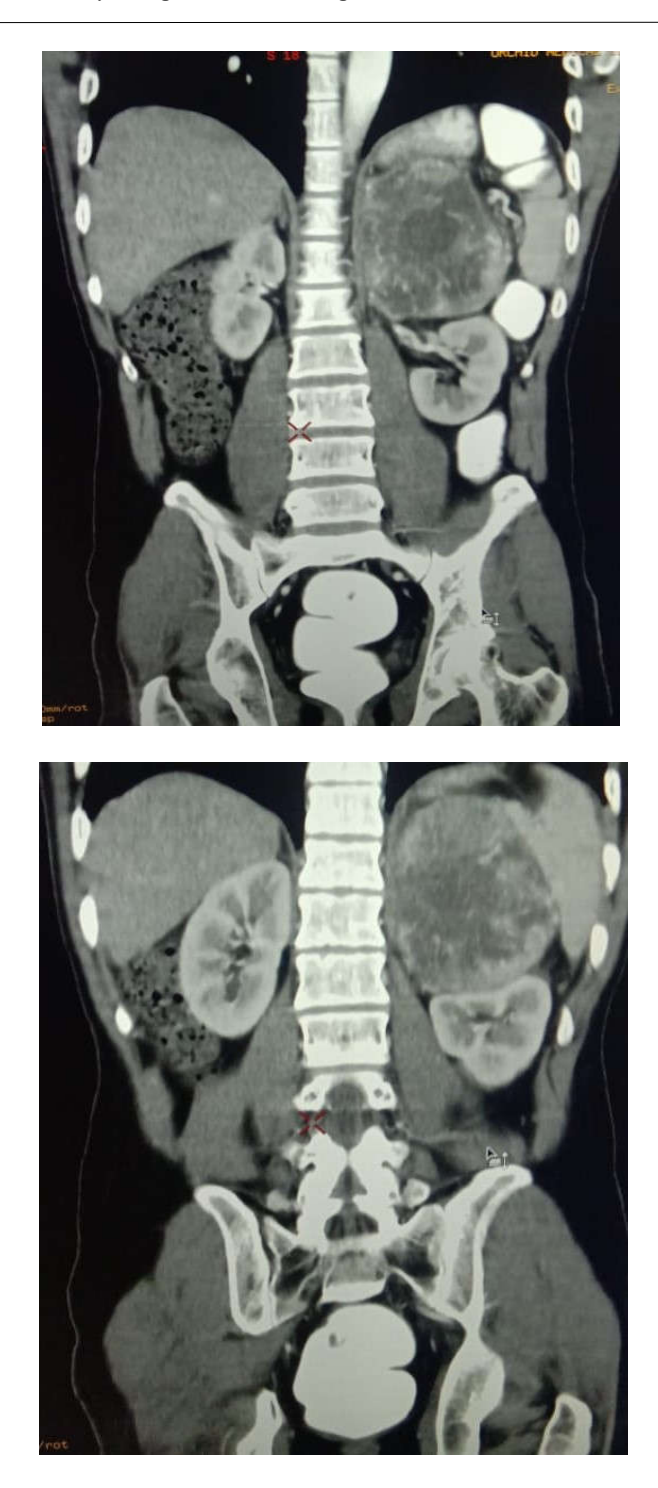
Fig 2. Longitudnal/coronal image of left adrenal tumor

Approximately 10% occur in children. The majority of cases are sporadic, with only 16% having a history of associated endocrine disorder such as Multiple Endocrine Neoplasia type II (MEN IIA and IIB), Neurofibromatosis 1 (NF1) and von Hippel- Lindau disease (VHL) (Karet, 1994). Approximately 10% of pheochromocytomas are malignant (Karet, 1994). Direct invasion of surrounding tissue or the presence of metastases determines malignancy. Unfortunately, no reliable clinical, biochemical or histological features distinguish a malignant from a benign pheochromocytoma. The clinical manifestations of a pheochromocytoma results from excessive catecholamine secretion by tumor. Catecholamine typically secreted, either intermittently or continuously, includes norepinephrine and epinephrine; rarely dopamine is secreted. The biological effects of catecholamines are well known. Catecholamine secretion in pheochromocytoma is not regulated in the same manner as in healthy adrenal tissue. Relative catecholamine levels also differ in pheochromocytoma.