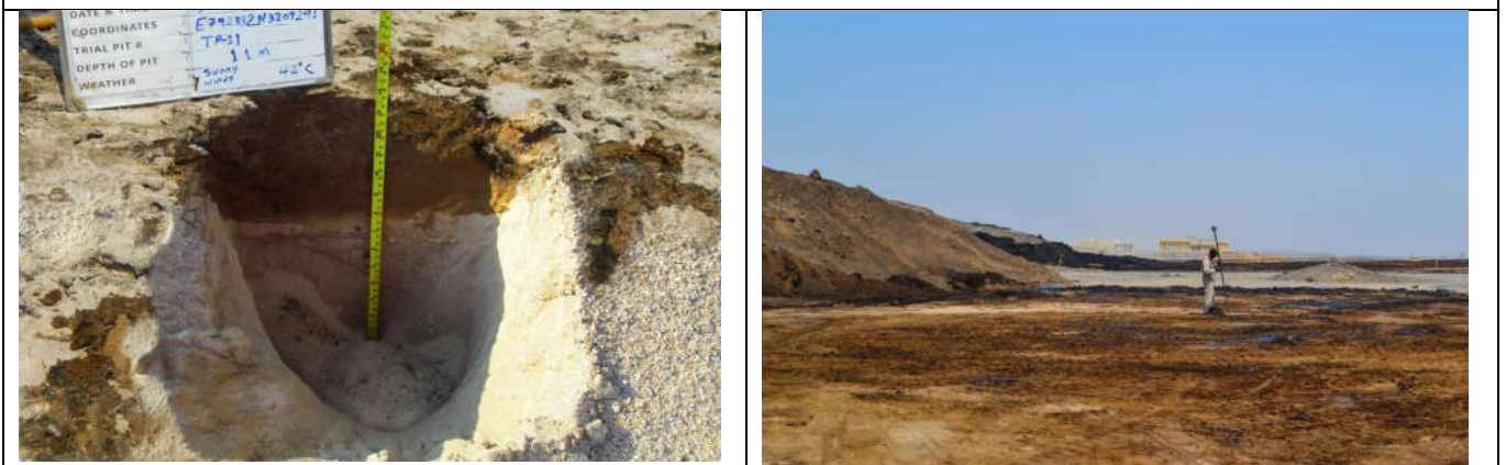
Fig. 3: Oil Contaminated Piles