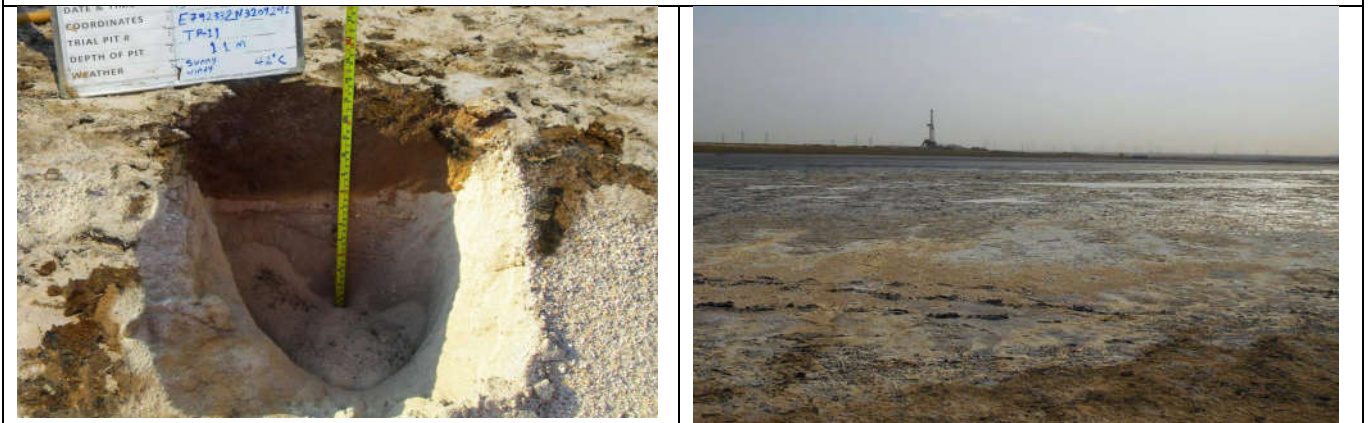
Fig. 2: Dry Oil Lake