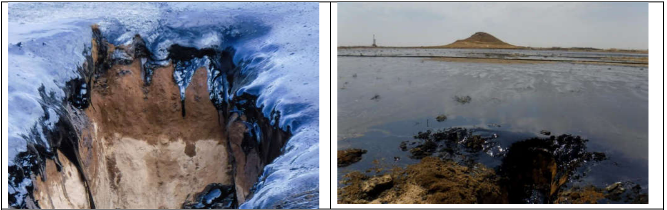
Fig.1: Wet Oil Lake