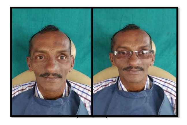
Fig. 11. Post-treatment extra-oral view

A two-piece dental stone cast was poured from the impression and the upper section was further divided into two equal parts for the easy retrieval of the wax pattern (Taicher, 1985). (Fig. 7) The wax pattern was placed into the socket for evaluation. Patient was instructed to move his natural eye in various directions and the required modifications were made on the wax pattern. The altered wax pattern was used to fabricate the final acrylic resin ocular prosthesis (Fig. 8). The measurements of the natural eye were accessed to coordinate the iris of the prosthesis and the position was determined using a grid (Fig.9). At a determined position the iris was incorporated in the custom-made eye shell. Characterisation of the comeal surface was done by removing a thin layer of acrylic resin and painting the surface similar to that of the natural comea and thin strands of red nylon fibers were painted to represent vessels along the outer periphery (Brown, 1970). The space created on the comeal surface was covered with thin layer of clear acrylic. (Fig. 10) The highly polished custommade prosthesis was placed into the ocular defect and was evaluated for iris and comeal colour, contour, dimension (Brown, 1970)(Fig. 11). The patient was educated about the insertion and removal of the prosthesis and the importance of careful cleansing and handling of the prosthesis.