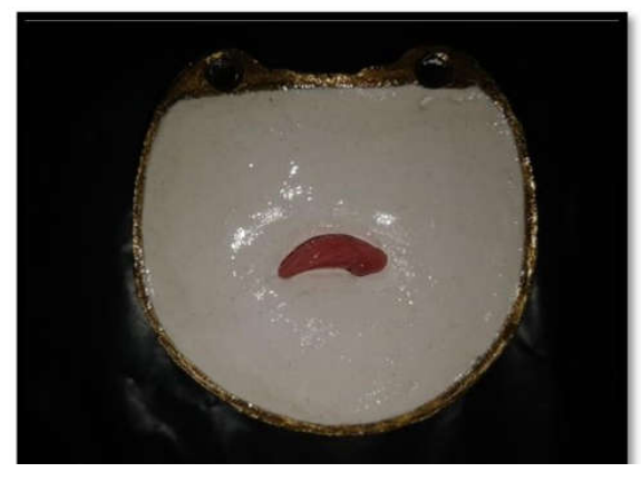
Fig. 8. Processing of altered wax pattern

Kalabhai, India) (Fig. 4) over which a custom tray was fabricated after adding a 2mm thick layer of spacer wax (Fig. 5). Final impression was made with the custom tray using Polyvinyl siloxane (PVS) light body impression material (Aquasil Densply USA)(Fig. 6).