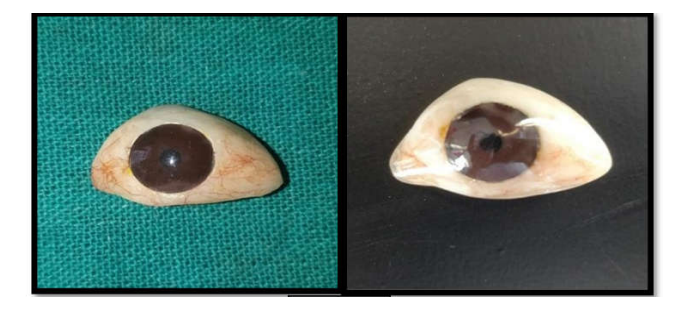
Fig. 10. Characterisation of corneal surface with final custommade eye prosthesis