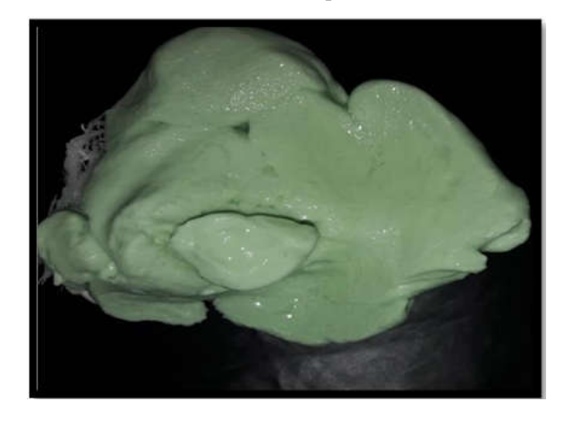
Fig. 3. Prim ary (Alginate) Impression