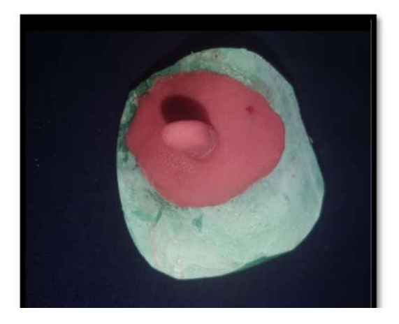
5. Custom tray