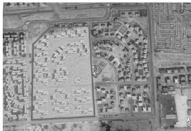
Fig.2: Site plan of New-Cairo social housing project (googleearth, 2019)