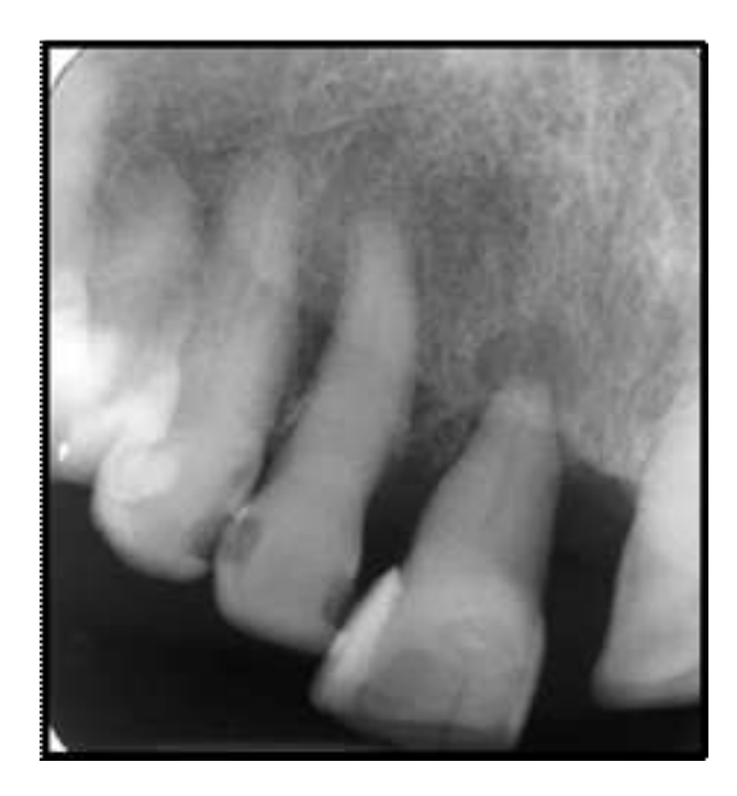
Fig 2. Too th 11 presented with extensive periodo ntal probing andmobility. The tooth was planned for extraction because of poorperiodontal prognosis, despite the probability of a favourableendodontic prognosis (Marshall, 1979).

The dentist should consider the strategic value of the tooth to be endodontically treated in relation to the overall function of the dentition. Insufficient periodontal support (Fig 2) may thus be viewed as a contraindication to root canal treatment. Periodontal management of patients is important to the longterm success of any treatment plan (Marshall, 1979). Conditions which limit a patient's ability to lie supine (e.g., spinal arthritis), to open the mouth wide (e.g., rheumatoid arthritis), or to tolerate rubber dam (e.g., anxiety disorders), may make endodontic treatment more difficult but not impossible (Messer, 1999). Following appropriate explanation of what is planned, the dentist should take into consideration the following questions that may influence the overall treatment plan and management (Pothukuchi, 2006):