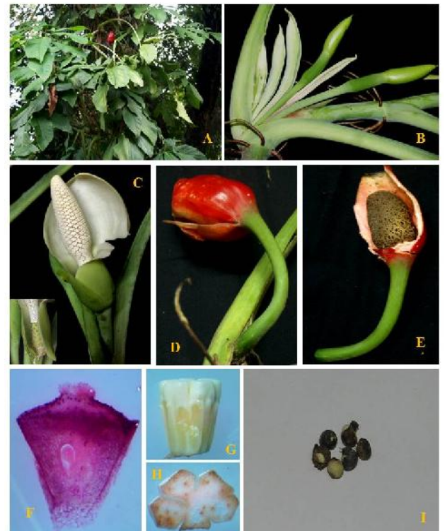
Fig. 2. A. Syngonium podophyllum at Sursuti Reserve Forest, B. Inflorescence, C. Spadix, D. Syncarp, E. Fruit, F. T.s of gynoecium, G. Synandrium, H. T.s of synandrium, I. Seed

Global Distribution: Native to Mexico, Central America (i.e. Belize, Costa Rica, El Salvador, Guatemala, Honduras, Nicaragua and Panama), parts of the Caribbean (i.e. Trinidad and Tobago), tropical South America (i.e. French Guiana, Guyana, Surinam, Venezuela, Brazil) and Tropical Asia (i.e. Malaysia, China, Peninsular Malaysia and Singapore) and now the new distributional record for India.