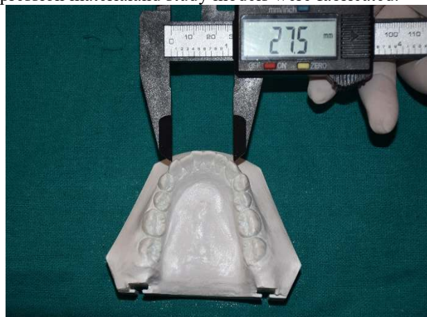
Figure 4. Measurement of inter canine distance in Mandible

Mesiodistal width measurement: The subjects were seated on a dental chair and impressions were taken with Alginate impression materialand study models were fabricated.