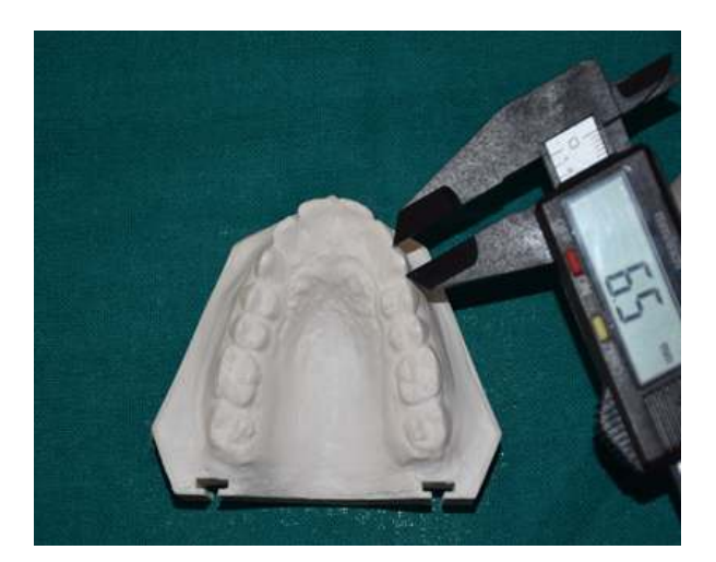
Figure 1. Measurement of mesio distal width of canine in Maxilla

spacing, periodontally healthy teeth, noncarious and nonattrited teeth, diastema or crowding and subjects with no clinical evidence of any restoration, orthodontic treatment, and trauma. The significant exclusion criteria for selection of the study sample were the presence of partially erupted/ectopically erupted teeth, patients with dental/occlusal abnormalities, teeth showing physiologic or pathologic wear and tear and patients with deleterious oral habits (like bruxism).