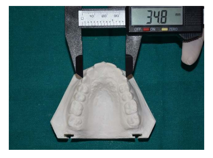
Figure 3. Measurement of inter canine distance in Maxilla

Mesiodistal width measurement: The subjects were seated on a dental chair and impressions were taken with Alginate impression materialand study models were fabricated.