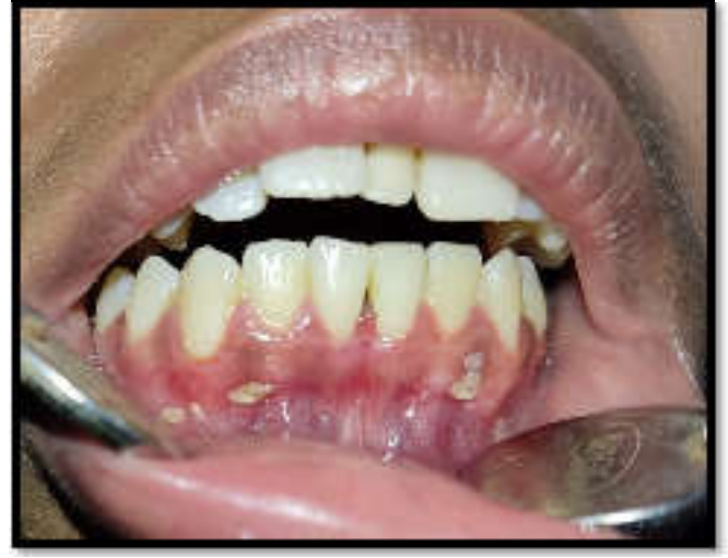
Fig.4. Three months Post-op view