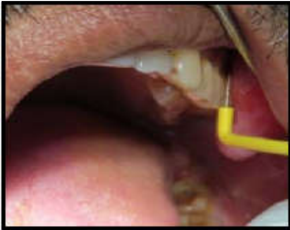
Fig. 8. Per-operative photograph of the procedure