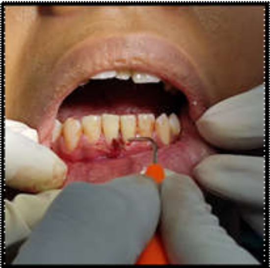
Fig. 2. Laser assisted excision of gingival overgrowth