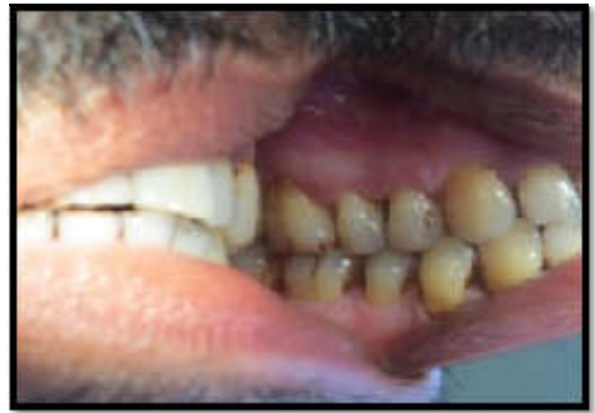
Fig.10. Three months post-operative view

Histopathological evaluation of the lesion revealed it to be pyogenic granuloma with proliferating capillaries, inflammatory infiltrate, along with the areas of fibrous connective tissue (Fig.11).