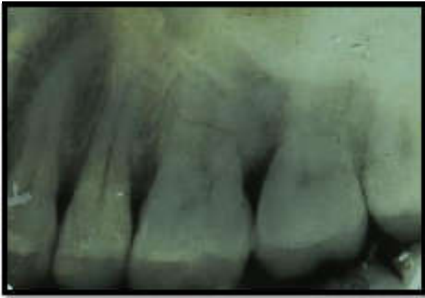
Fig. 7. Pre-operative radiograph of the lesion

Oral hygiene of the patient was found to be poor. Radiographic examination revealed no bone loss in 26,27 region (Fig.7). The patient had undergone Phase I therapy followed by laser assisted excision of the localized gingival overgrowth (Fig.8 & Fig.9).