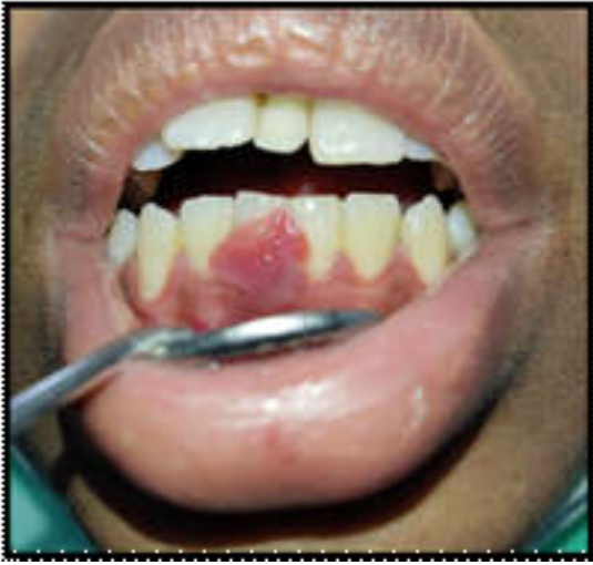
Fig. 1. Pre-operative photograph of the lesion