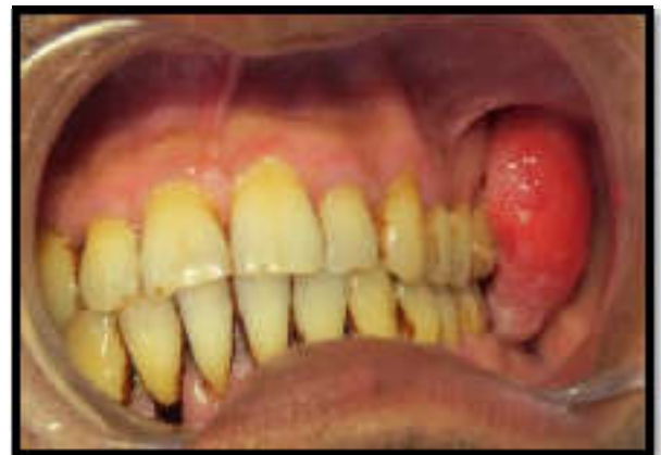
Fig. 6. Pre-operative photograph of the lesion

A male patient aged 45 years reported with chief complaint of swelling in the left upper jaw region for last three months. The swelling gradually increased in size for last six months. The patient was found to be systemically healthy. On clinical examination, a solitary, firm, erythematous, sessile growth of 2cm X 1cm was noted in 25,26,27 region(Fig 6).