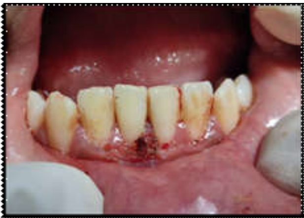
Fig. 3. Immediate post-op view of the lesion