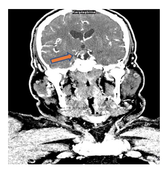
Figure 1. 15x11mm thrombosed basilar artery aneurysm distal to the basilar artery in cranial CT angiography imaging (red arrow)