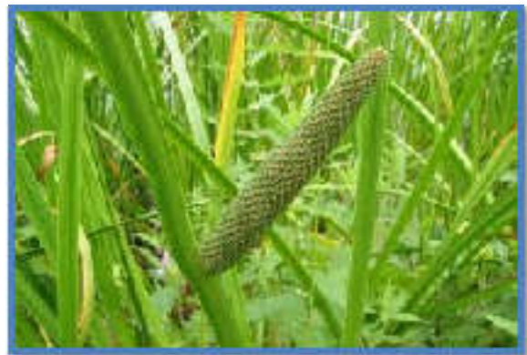
Common name: Sweet flag Scientific name: Acorus calamus L. Plant part used as insecticide: Essential oil for Rhizome.