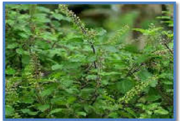
Common name: Tulsi Scientific name: Ocimum tenuiflorum L. Plant part used as insecticide: Leaves and its essential oil