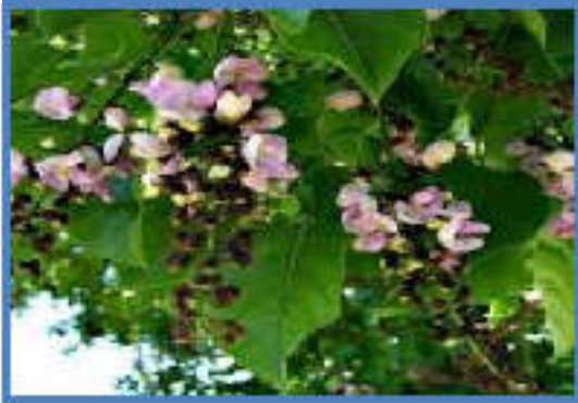
Common name: Indian beech. Scientific name: Milletia pinnata (L.) Panigrahi Plant part used for insecticide/pesticide: Seed oil.