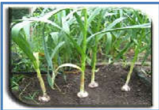
Common name: Garlic Scientific name: Allium sativum L. Plant part used as insecticide: essential oils of seed and fruit.