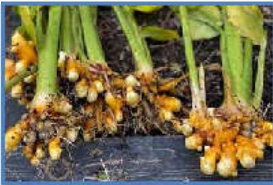
Common name: Haldi Scientific name: Curcuma longa L. Plant part used as insecticide: Fresh Juice, Rhizome Powder, and leaf essential oil.