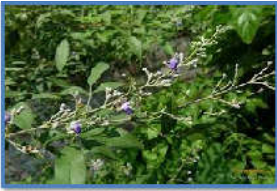
Common name: Chinese chaste tree Scientific name: Vitex negundo L. Plant part used for insecticide/pesticide: essential oils from leaves.