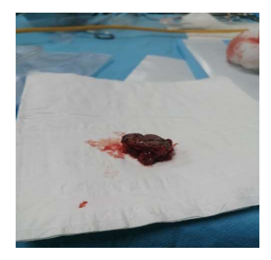
Figure 2. Surgical specimen of the endometriotic nodule after its resection