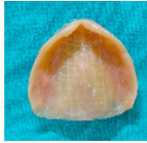
Figure T. Denture incoperated with resin reinforced glass fiber mesh