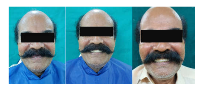
Figure U. before denture placement, after denture placement, follow up after 6 months