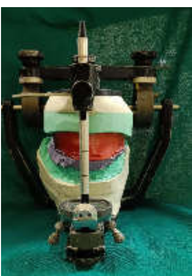
Figure Q. Face bow transfer done and mounting of semia djustable articula tor