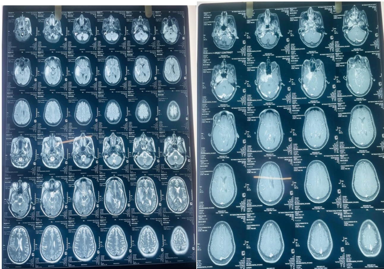
Fig. 4 & 5 (MRI brain T1W image showing Trigeminal schwannoma)