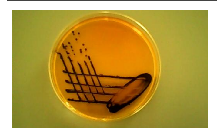
Plate 1. Characteristic transparent colonies with black centre by Salmonella species on SSA (as shown by the arrow)