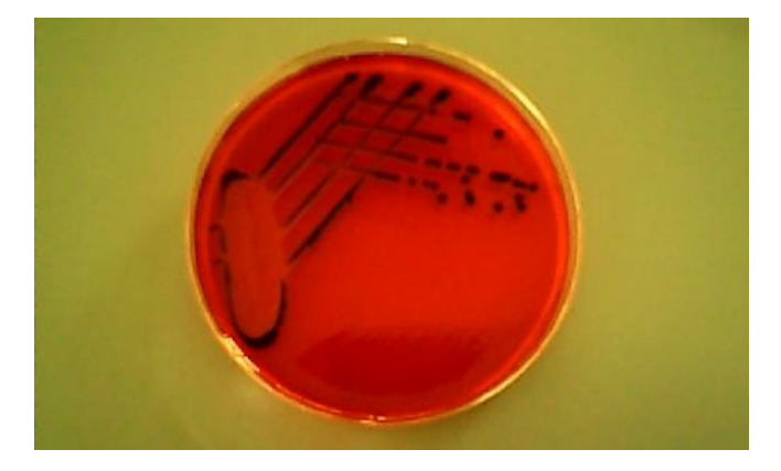
Plate 2. Characteristic red translucent colonies with black centre colonies by Salmonella species on XLD agar (as shown by the arrow)